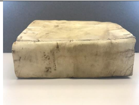
Image 2 - Spine